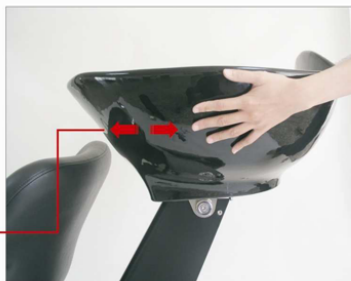
3. Adjust basin as required by moving forward and backward