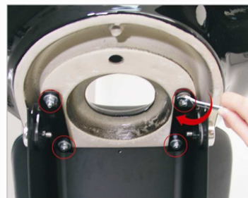
4. Tighten down the basin bolts with the wrench provided on each carriage screw