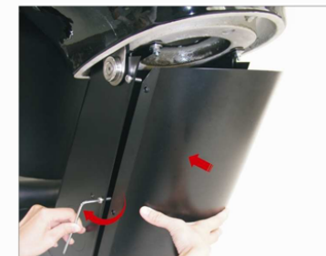
5. Refit back cover using the screws provided