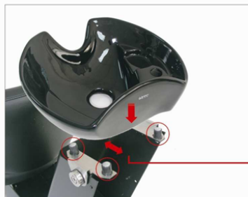
2. Fit the basin onto the body support